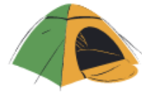
SHELTER R300 PER TENT