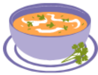
SOUP FEEDING R10 A MEAL

Support our Winter Warmth initiatives and make your contribution today.